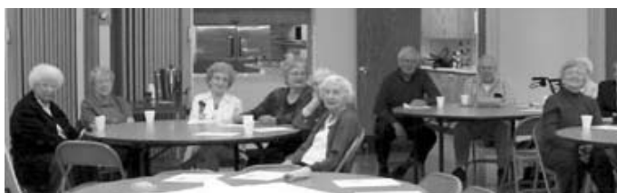
Bethany Lutheran Church Adult Forum

Members of the Bethany Lutheran Church adult forum also offered their input in late September, highlighting their concerns about crossing Hiawatha not only for themselves but also for high school students. And even though most participants were retired seniors who had the option to travel outside of rush hours, they nonetheless experienced the same frustrations expressed by others and the sense of being forced onto Minnehaha to get anywhere. They appreciated the LRT but insisted on more and safer off-street parking that would keep cars out of neighborhoods.