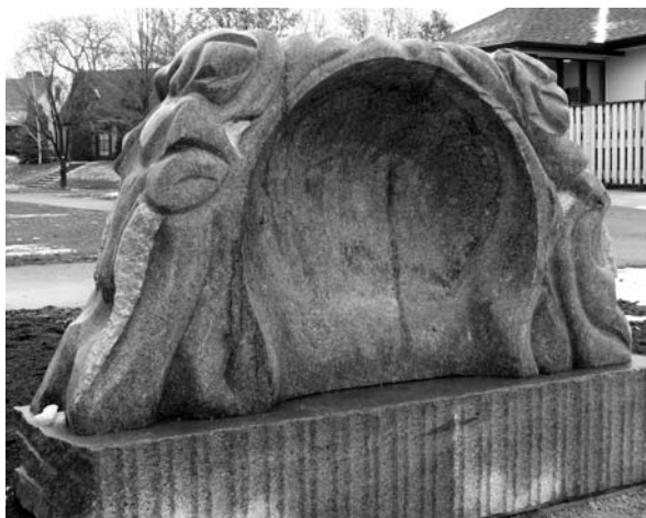
The Listening Vessel.