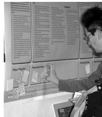
Forum participants added their own suggestions and comments.

As always, the Community Advisory Committee and project team welcome your input and ideas via the Web page and