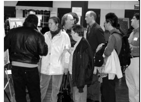
Participants at the community forum at Sanford Middle School gathered around one of the many displays.

In mid-November, the Community Advisory Committee and Longfellow Community Council hosted a major community forum at Sanford Middle School. This evening event was open-house style, where visitors could learn about information and input gathered to date and offer their own ideas on improving the quality of life in the corridor. The forum included stations covering mobility; land use and physical resources; environment and natural resources; cultural resources, heritage, arts, and entertainment; economic development; and livability and community image. In separate rooms, county consultants presented results of concurrent studies on the railroad corridor, area retail and industry, and corridor culture and history. There were also activities for children to put their creativity to work. We welcomed more than 100 community members and several elected officials who came to both listen and contribute as the county continues to gather community perspectives to guide investments in the corridor.