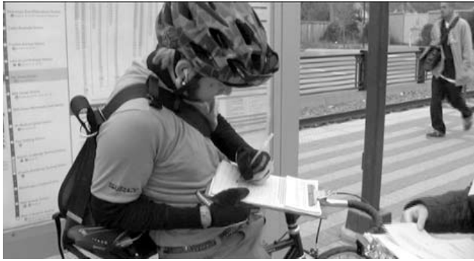
An LRT rider completing a survey.

No matter what neighborhood you live or work in, the Minnehaha-Hiawatha corridor's historic mills, railroad, industrial uses, and major roadways have shaped your community. As Hiawatha was reconstructed and light rail added in recent years, new opportunities as well as some challenges have emerged. What hasn't changed over time, however, is that most residents and businesses came to—and stay in—this part of town by choice