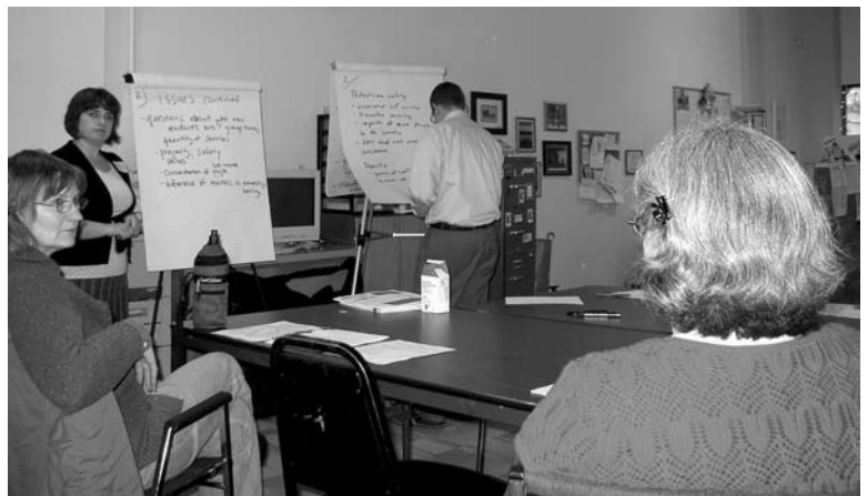
Residents of the Standish and Ericsson neighborhoods contributing ideas at a meeting.

Community input began immediately after the program was launched, with support from the Longfellow, Standish-Ericsson, and Corcoran community councils and guided by the CAC. Pub-