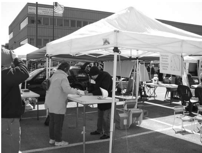
A shopper at the Midtown Farmer's Market discussing concerns about the corridor.

Members of the Community Advisory Committee (CAC) are serving as “stewards” of the public involvement process. Ap-