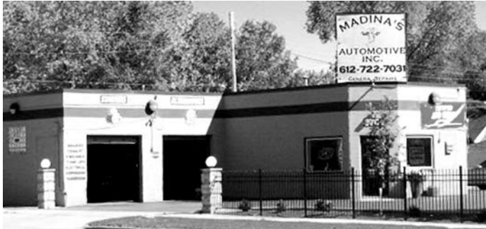
Madina's Automotive, 3701 Cedar Ave. S.