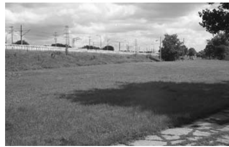
This is the proposed garden site, looking southeast from the corner of 32nd Ave. S. and E. 41st St. The light rail line (electricity lines visible in the background) cuts it into a triangular lot.