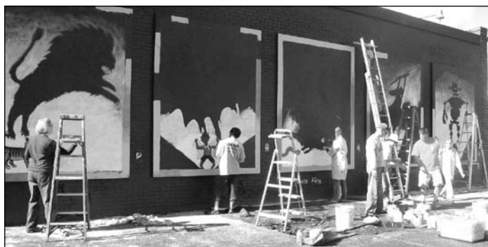
Volunteers help to restore the fantasy mural at DreamHaven comics and science fiction bookstore on 38th St.