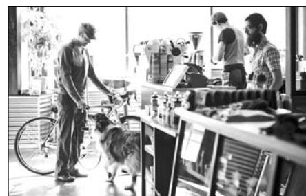
Coffee and bikes at the Angry Catfish, 4208 28th Ave. S.

You can call the Angry Catfish at 722-1538 or browse www.angrycatfishbicycle.com . Hours are Monday to Friday 7:00 a.m. to 7:00 p.m.; Saturday and Sunday 8:00 a.m. to 5:00 p.m.